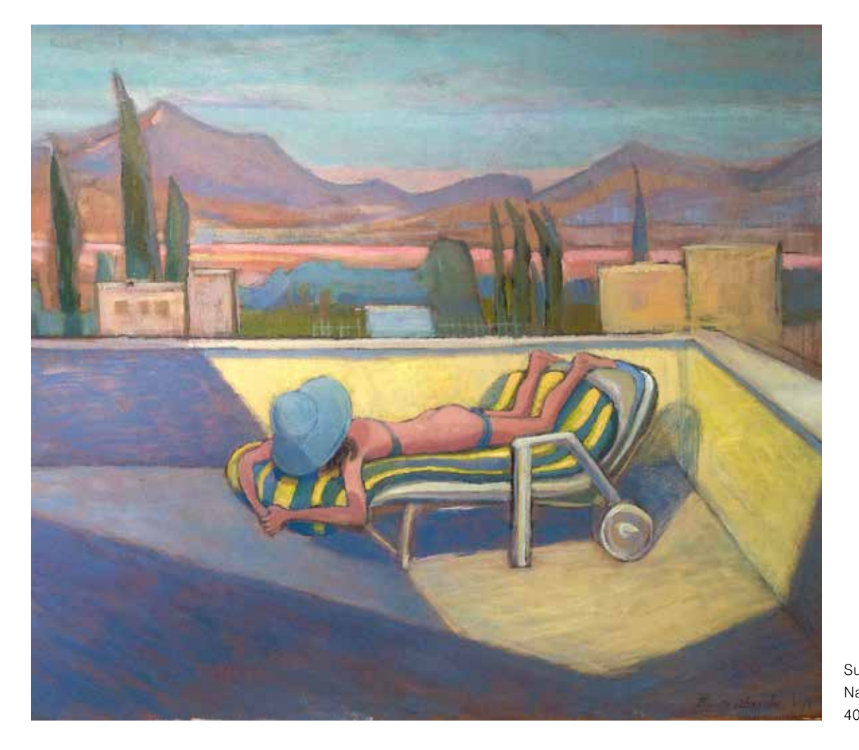
Sunbathing Naomi Alexander 40 x 30 inches | £2,250