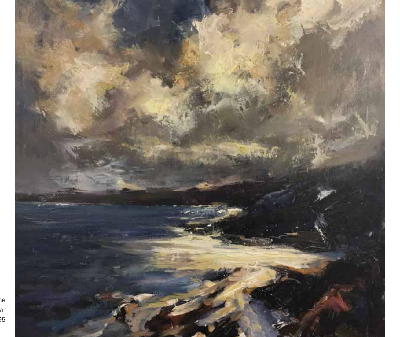
Devon Coastline Roger Dellar 20 x 20 inches | £1,895