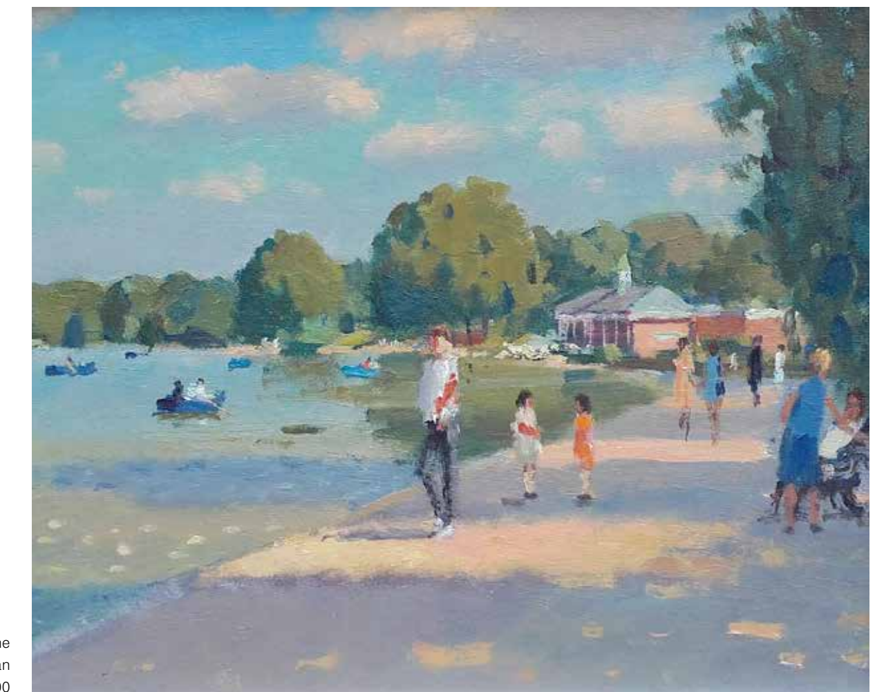
By The Serpentine Ronald Morgan 12 x 9 inches | £400